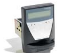
Build-In Vending Module